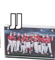
II-JJ) 4X6 ACRYLIC BLOCK: $25 Photo between polished acrylic front and metal back, choose individual or team