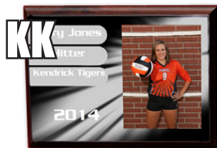
KK) 5X7 PLAQUE: $20 Cherry wood base with acrylic cover