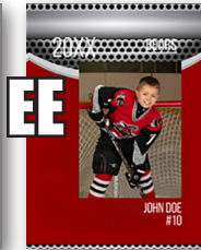
CC-EE) 12 TRADER CARDS: $18 2 1/2" x 3 1/2" double-sided cards personalized with athlete's info and team color