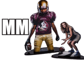
MM) STATUETTE: $30 5x7 image cut out mounted to Masonite