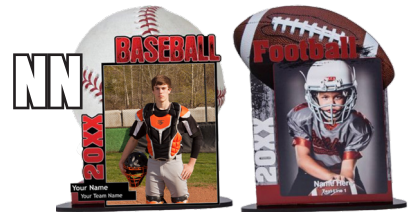
NN) STAND UP: $25 8x10 laser cut and mounted to Masonite

Athlete Name (First and Last Name, please print clearly)