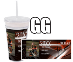
GG) TUMBLER: $20 16 oz., 6" tall, includes acrylic straw, not dishwasher safe