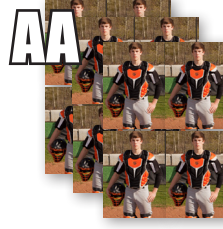
AA) 12 WALLET ATHLETE PRINTS: $15 2 1/2" x 3 1/2" prints