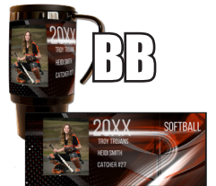
BB) TRAVEL MUG: $20 16 oz., 7" tall, not dishwasher safe