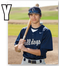
Y) 8X10 ATHLETE PRINT: $11