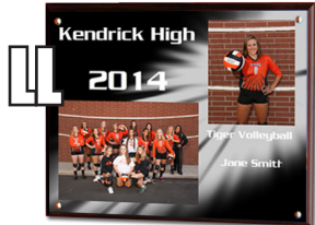
LL) 8X10 PLAQUE: $25 Cherry wood base with acrylic cover