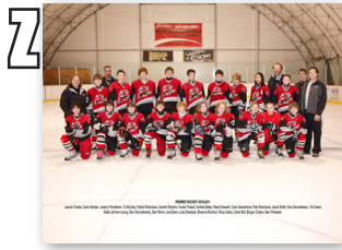
Z) 8X10 TEAM PRINT: $13